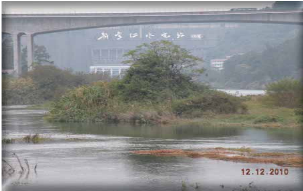
Xinfengjiang Hydropower Station: one of the five biggest hydropower stations in China, generates more than 1 billion kW•h in average annually.