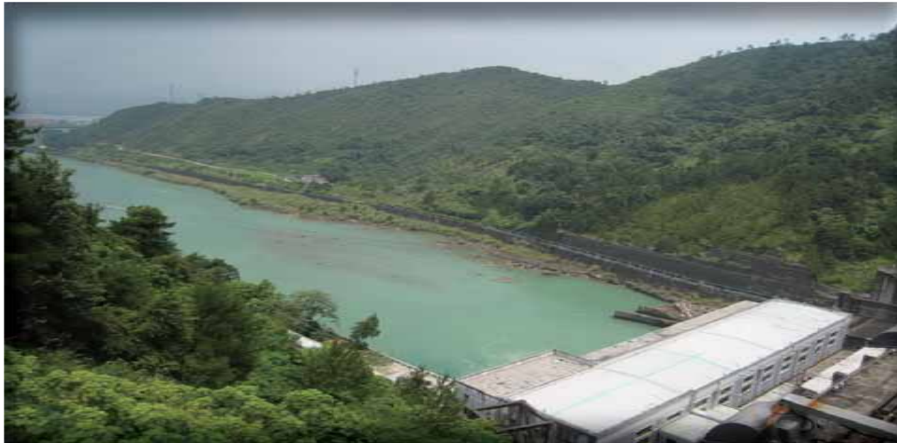
Xinfengjiang Reservoir is the largest tributary of Dongjiang River. Build in 1950s.

Due to the construction of Xinfengjiang reservoirs, 28,333 hectares forest and paddy 12,000 hectares have been flooded. 100 thousand residents lose their field, and 200 thousand people live along the reservoir have to migrant outside. These affected residents accounted for 65% of the total province population. As Heyuan City has the obligation to protect the water quality, the surrounding industrial, forestry and tourism development is strictly limited.