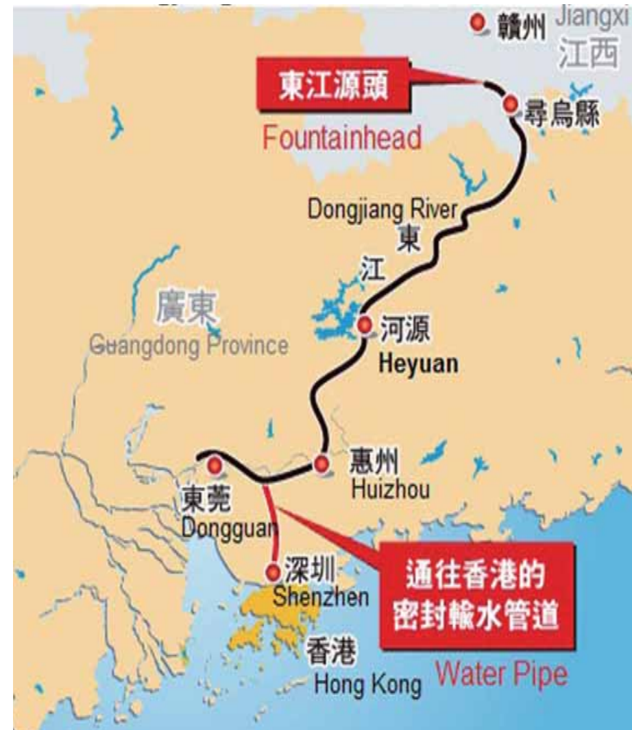
Dongjiang River Fountainhead

(Ming Pao Daily News on 23 November, 2008)