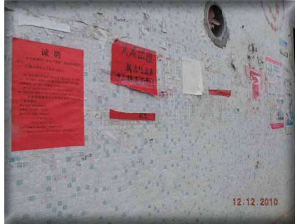
' Recruitment ' and ' room for rent ' notices posted on the wall. A villager explained, those villagers who have some money would usually move out, and their house will be kept and rented to immigrant workers.