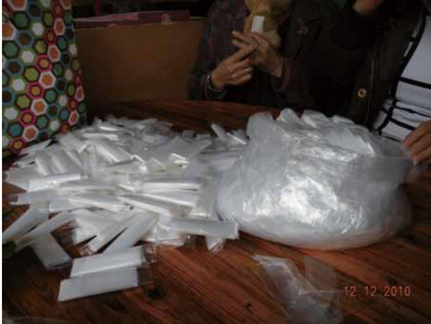
Some women earn money by packing plastic gloves. For 250 gloves, they are paid 2.5RMB, so generally they can earn 7RMB for one day.