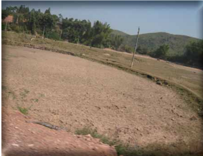
Abandoned land. Villagers are too far away from this agricultural land or lack of usufruct.

The rainfall has decreased since last year. Drought increases the burden of villagers.