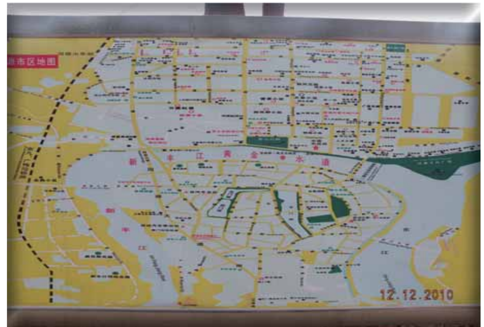
The maps of He Yuan city central: reservoir and the Dong Jiang River cover almost half of the land area..