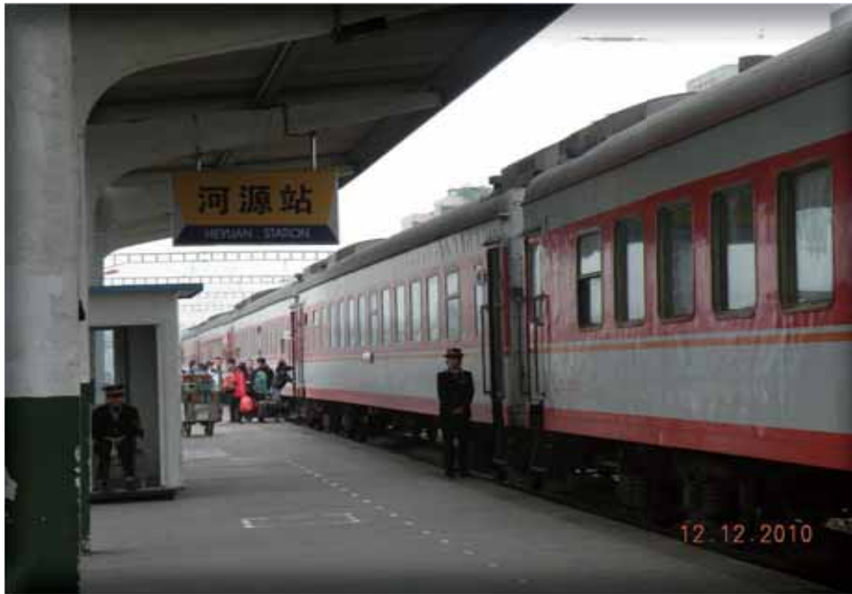
Travelling from Hong Kong to He Yuan takes 3-4 hours.