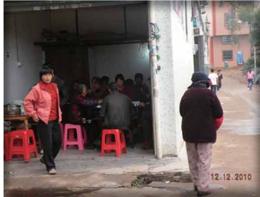
The noise of Mahjong can be heard around the settlement. It is the most common way for residents to spend their time.