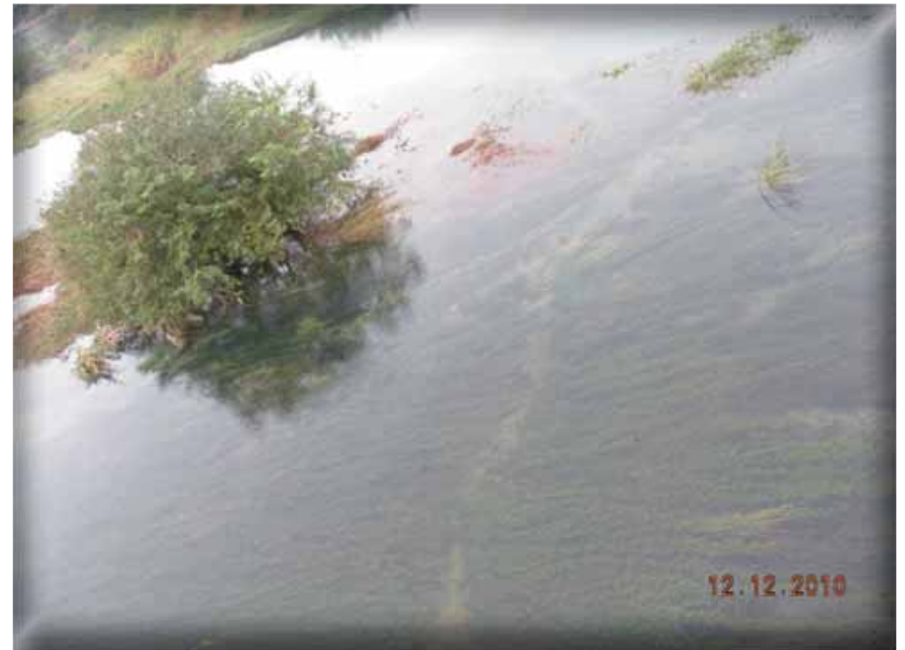
Plants such as Seaweeds are planted for water purification.