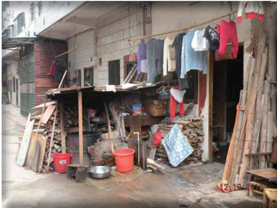
The room is too narrow and lacks of a ventilation system, so some villagers choose to cook outside.